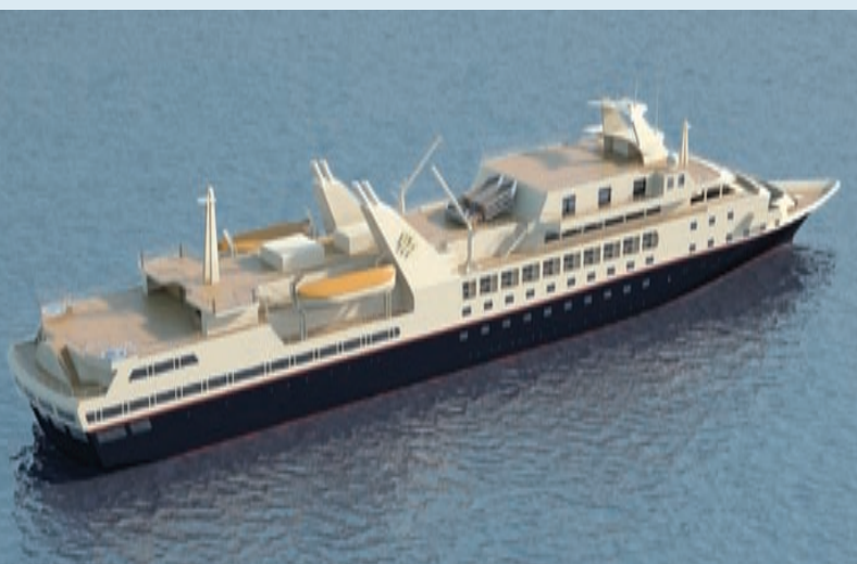
Artist's rendering of Silversea Cruises' Prince Albert II

couples seeking an out-of-the-ordinary voyage to less-touristed ports in places like Asia and South America. Hideaways Aficionado Club member-only perk: A $50–$100 shipboard credit per stateroom, depending on sailing, and a bottle of wine.