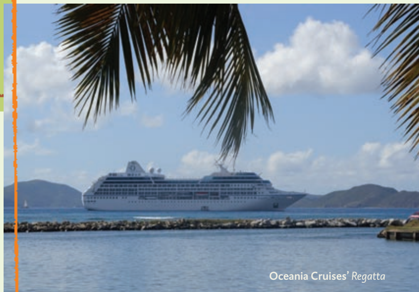
Oceania Cruises' Regatta